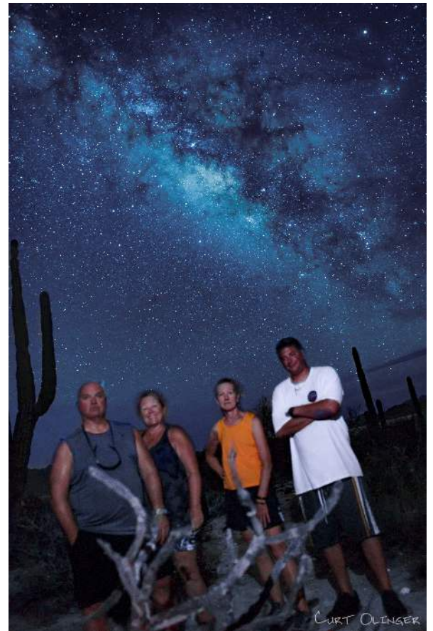
Las Animas Ecolodge: Best Dark Skies on the Planet